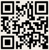
QR for experiences

Private sessions with our specialists, whether partaking in Pilates, yoga or personal training, can also be enjoyed, offering you the space to reconnect with yourself, enhance your physical and mental wellbeing and cultivate a deeper sense of inner awareness.