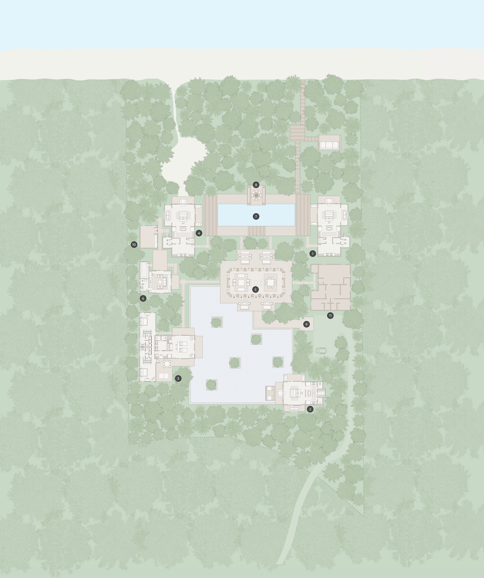
Villa 3 6-bedroom Amanyara Villa