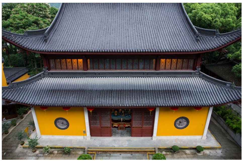
Temple Trail: Three Temples of Tianzhu 天竺三寺

A trail that begins near Amanfayun's entrance traces the original Tianzhu Pilgrim Path, linking the upper, middle and lower Temples of Tianzhu (the ancient Chinese name for India). All three feature a variety of images of Guanyin, the Goddess of Mercy. Faxi Temple (Temple of Happiness) is the upper temple – the largest of the three – established between 906 and 970 AD. Just south lies Fajing Temple (Temple of Purity), established by the Indian monk, Master Baozhang, in 597 AD. The lower Temple of Reflection was established by the Indian monk, Master Huili, in 330 AD. Surrounded by tea fields and a small village, today this temple is one of the very few nunneries in Hangzhou.