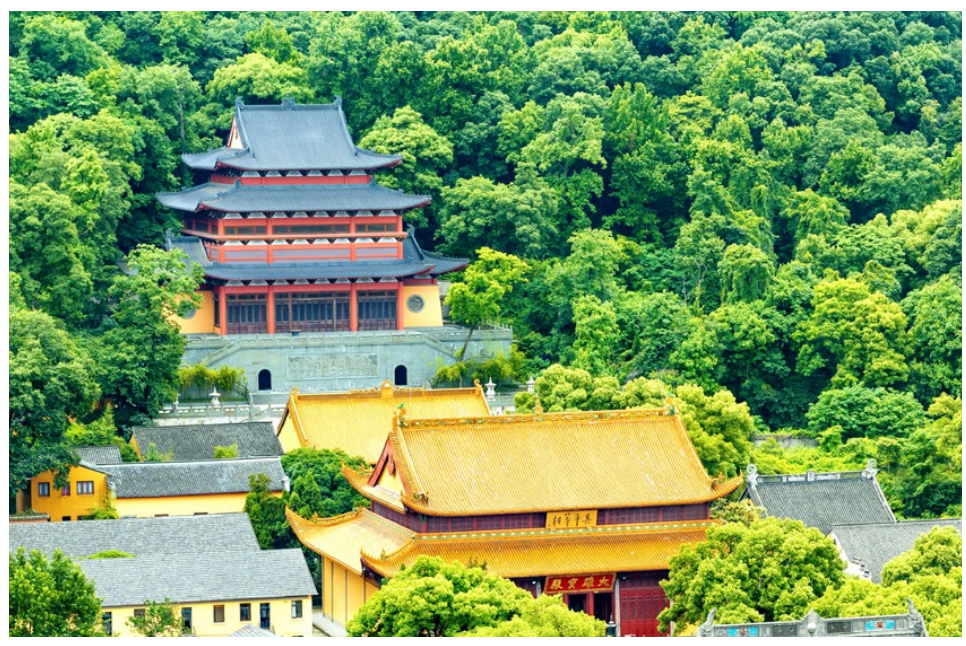
Temple Trail: Jingci Temple 净慈寺

Another temple of interest farther afield is Jingci Temple, situated south of West Lake. It was originally built in 954 AD by Qian Hongji, the king of the Wuyue dynasty, for a famous monk named Yongming. The temple offers one of the 'Ten Views of West Lake' known as 'Evening Bell Ringing at Nanping Hill'.