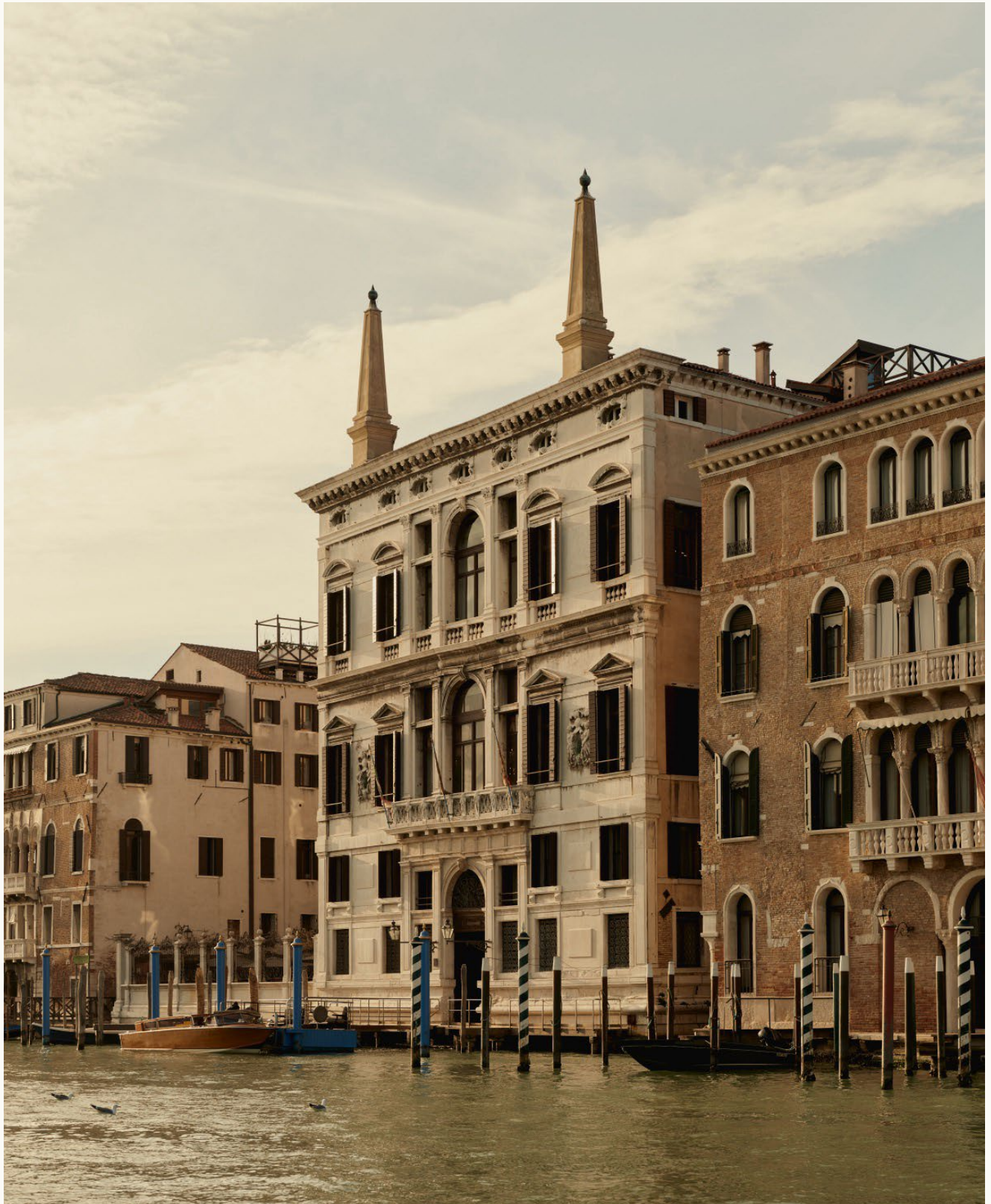
Palazzo Papadopoli Calle Tiepolo, 1364 30125 Venice, Italy TEL: +39 041 27 07 750 EMAIL: amanvenice.spa@aman.com